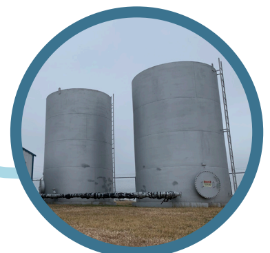
3: Storage Tank